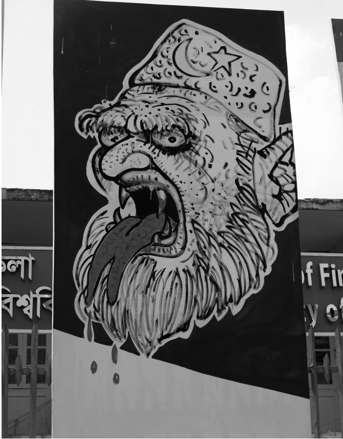
Figure 9.2 Portrait of a collaborator at Shahbag.

cultural heritage. In this particular interpretation of the footage, the journalist draws from a well-worn language of culture wars—Bengali/secular vs. Islamic—that found loud expressions in the antagonism between Shahbag and Hefazot crowds. The reporter concludes by suggesting that an Islamist conspiracy is behind the attacks on Bangladesh’s largest secular cultural institution.