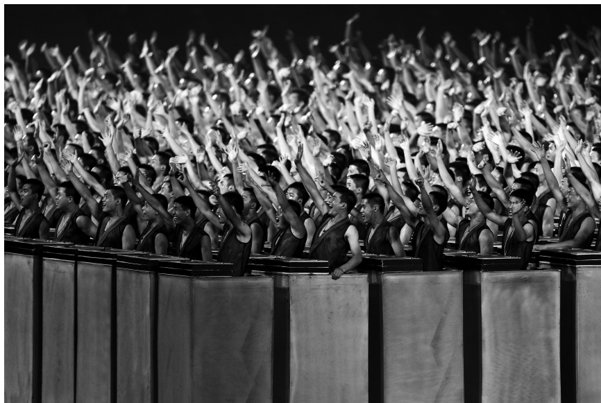
Figure 5.1 Performers emerge from the top of moveable-type blocks after a long routine during the 2008 Beijing Olympic Opening Ceremony

The choreographed crowd is what we're used to seeing in the PRC during its periodic public displays of national unity and strength. Think back to the 2008 Beijing Olympic Opening Ceremony, which is probably the most widely watched example of the PRC's choreographed crowds. The Opening Ceremony began with 2008 drummers dancing and chanting in unison; later, a new set of performers hid inside a set of human-sized movable type blocks moving up and down in an extremely coordinated display until finally emerging from the top to smile and wave at the audience (Figure 5.1). This sudden shift both breaks the fourth wall by demonstrating the method behind the spectacle and forces the audience to have a revelation reminiscent of Charlton Heston's character's disturbing epiphany at the end of the film Soylent Green (1973): This impossibly complicated routine is made out of people! And indeed, that seems to have been the intended effect. Throughout the ceremony, thousands of performers showcased what director Zhang Yimou called a "human performance" where "uniformity brings beauty" in a 2008 interview with Southern Weekend . 1 Zhang argued that this uniformity reflected something particularly Chinese: an ability to be disciplined, hardworking, and obedient unparalleled by all other nations (besides North Korea).