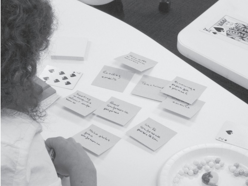
Figure 4.2: An Indie Interfaces Symposium attendee mulls over the tasks that comprise their average workday. Taken by a researcher during the taskscape workshop portion of the symposium.

and each member of each group was instructed to use post-it notes to write out as many aspects of their daily routine as they could reasonably manage. Once finished, the post-it notes were sorted and grouped into a number of loose themes. The purpose of the exercise was to highlight commonalities across the seemingly disparate roles played by the cultural intermediaries in attendance; it also provided the researchers in attendance with a valuable source of information about the quotidian reality of performing cultural intermediation labour.