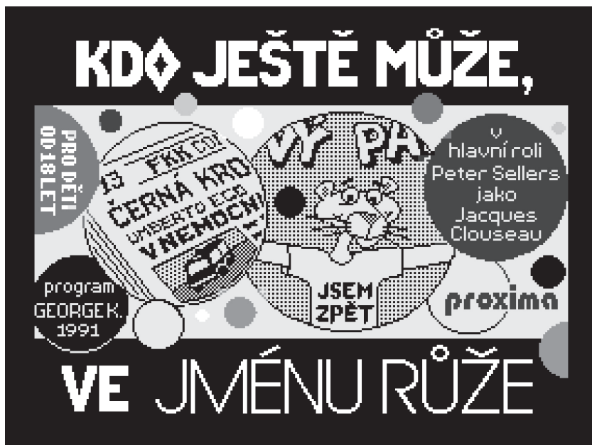
Figure 12.2. Title screen of The Name of the Rose , advertising that Peter Sellers stars as Jacques Clouseau. The newspaper clipping shows an ambulance driving a hospitalized Umberto Eco. Artwork used with permission of the author and copyright owner Jiří Koudelka.

Island (Lucasfilm 1990). Rather than an adaptation of the Umberto Eco novel, it was a free-wheeling pastiche of content that was popular at the time or dear to its author, Jiří Koudelka. The game takes place at a female convent in the present day, and the main character is inspector Clouseau from the Pink Panther films. Unsurprisingly, it also includes references to Indiana Jones (namely, his whip) and other icons of Czechoslovak ZX Spectrum gaming. Reflecting the flamboyant atmosphere of the 1990s transition to capitalism, the game also features crude sex jokes, several sex scenes (although told mostly through text descriptions), and a cameo by the then-famous German erotic TV game show Tutti Frutti . The game was marketed as an adult-only title, which made it especially attractive to teenagers. With around 1,300 copies sold, it was already considered a commercial success (Jiří Koudelka, personal communication). An even more ambitious (but quite somber) 8-bit point'n'click adventure Twilight: Land of Shadows (Dekan, Javor, and Grellneth 1995) was released as late as 1995 by the Slovak publisher Ultrasoft, and became the company's last published title. Peripheries thus continue to serve older platforms after they become obsolete in the centre.