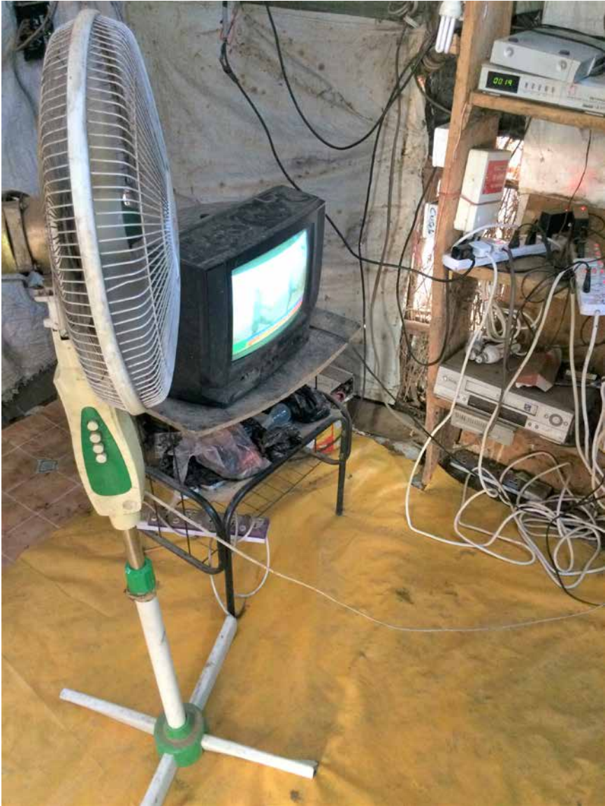
Figure 1.9. TVs and fan in Kakuma, Kenya.