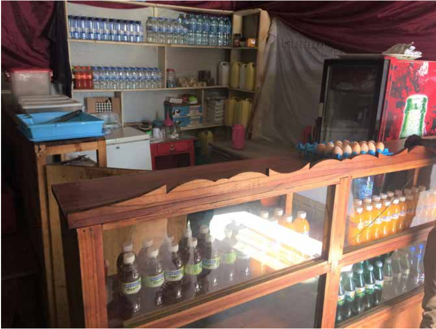
Figure 2.5. Milk-bar café and shop using solar power, Nyabiheke, Rwanda.

shared background after moving from similar areas within the Democratic Republic of the Congo (DRC). In Kakuma differences were more pronounced. There was a considerable sense of community support within national groups. For example, Ethiopian business owners were supportive of Ethiopians, and the same went for the Somalis, Congolese, South Sudanese and other groups within the camps. As I have argued elsewhere in the case of Kenya, ‘the cultural background, sense of community, and refugee’s own resources, all have influence on levels of energy access’ (Rosenberg-Jansen, Njoki and Okello 2018: 6). However, perhaps as there are fewer national groups within the Rwandan camps than in Kakuma, national connections appear to be less pronounced in the three Rwandan camps.