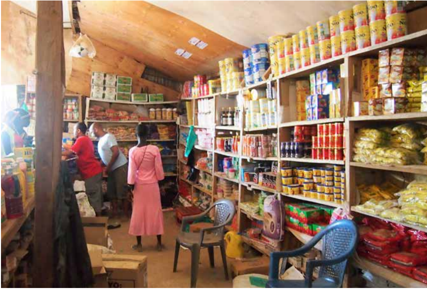
Figure 1.7. Household cooking goods for sale in Kakuma, Kenya.

think of the appliances – the design and efficiency of our ovens, stoves, kettles, fridges, lamps and computers. And, of course, of the cost of energy – how much we spend on our electricity and gas bills. In many ways life in refugee camps is not so different. The uses of electricity and cooking resources are still critically important. The social and practical benefits of energy, the physical connections and the economic costs of energy drive refugee perceptions and values of different electricity and cooking technologies. Energy is valued for what it provides , not necessarily what it is.