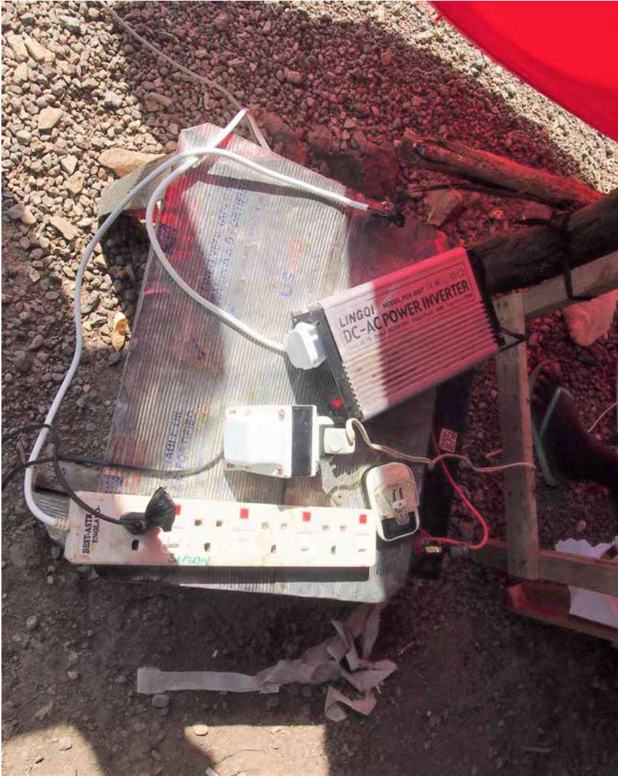
Figure 1.3. Extension cables, chargers and connectors in a home in Kakuma, Kenya.