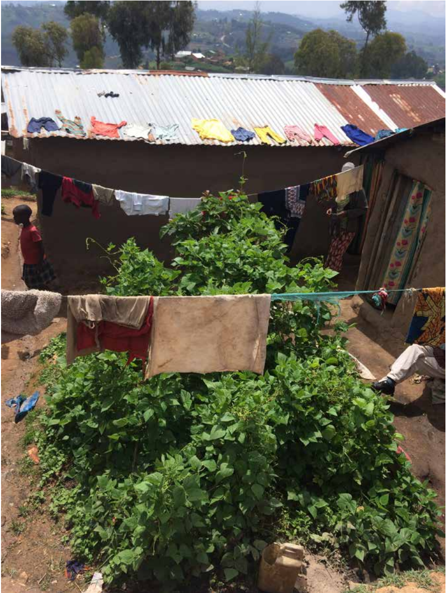
Figure 1.5. Kitchen garden in Kigeme, Rwanda.