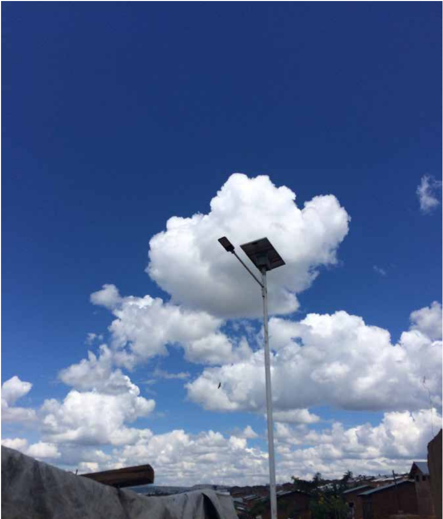
Figure 3.1. Solar streetlight in Mahama, Rwanda.

As the following sections will describe, while there was considerable evidence of energy needs and uses in both community facilities and