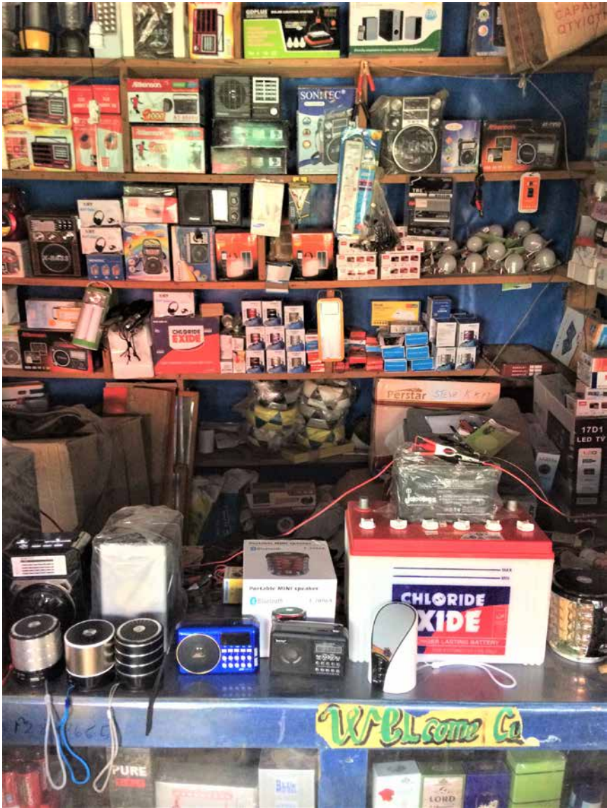
Figure 2.1. Electrical products such as batteries, torches, light bulbs and radios for sale in a shop in Kakuma, Kenya.