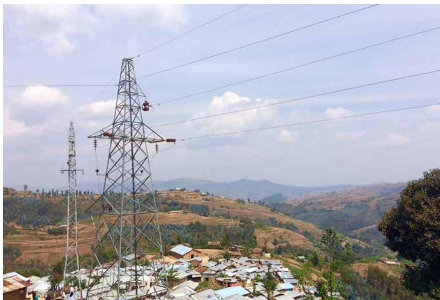
Figure 3.5. Electricity connections overhead in Kigeme, Rwanda.

to pump water to irrigate the gardens of the compound and mobile phones were charging in many sockets. Electricity was very visible within the camps. Despite this, during our discussion the interviewee commented: ‘We don’t use energy [for ourselves in the operations]. We have some lights and that is it ... That energy surrounding our office is all provided by someone else, we don’t do anything about it. It is not ours and we are only switching on the lights and the computers’.