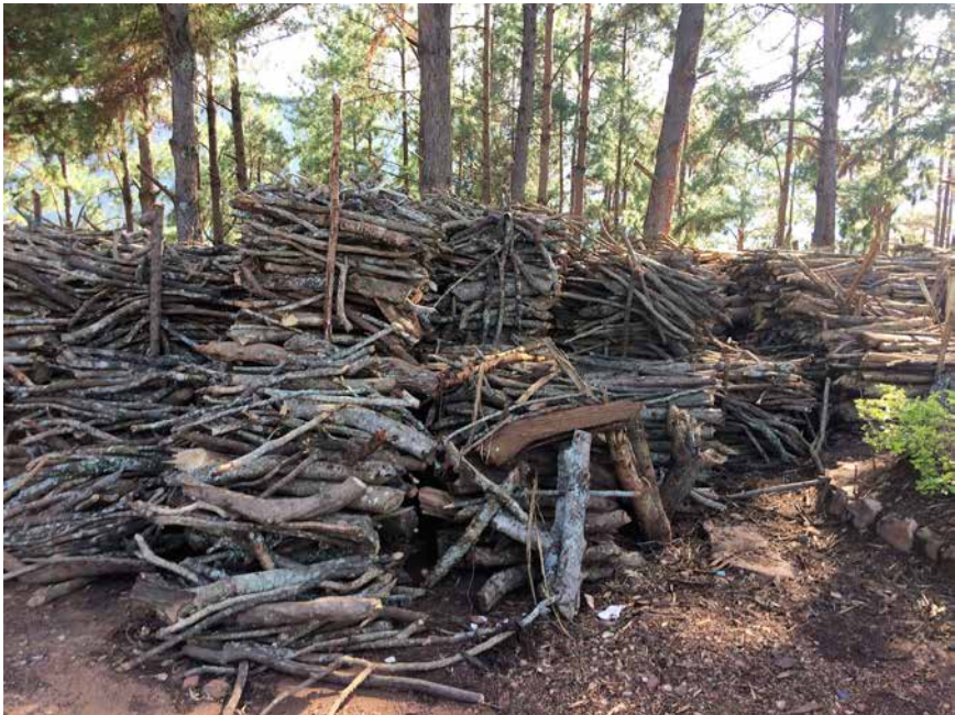
Figure 4.1. Stacks of firewood at the firewood-distribution point in Nyabiheke, Rwanda.

Beyond this description, however, is a complicating factor. While many refugee families are reliant on energy provision and cash assistance from humanitarian organisations, when it comes to energy many refugees