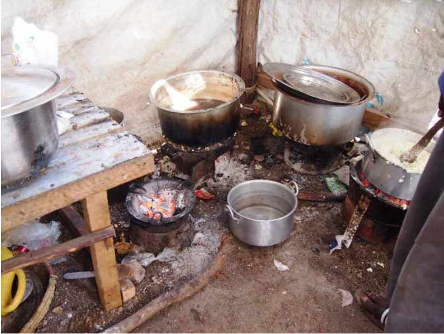
Figure 1.4. Cooking equipment in a refugee home in Kakuma, Kenya.

able to create kitchen gardens, or small separate kitchens next to their main home, but often cooking was done immediately inside or outside homes. The outdoor spaces of cooking were vibrant and noticeable in all the camps. Where physical outdoor space was available many people would cook between their homes – in the small alleys or ‘yard’ spaces outside the dwellings. For example, in some parts of Kalobeyei refugees were allocated garden spaces next to their shelters, which were frequently filled with cooking pans, pots, cookstoves, washing and small containers growing vegetables. Firewood was sometimes stored on top of houses, or often in a corner of homes to avoid theft or rain.