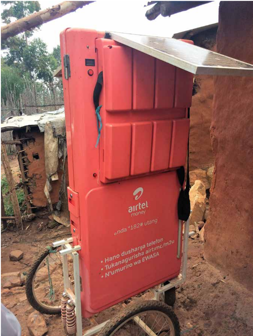
Figure 2.3. Solar-powered phone-charging technology in Nyabiheke, Rwanda.