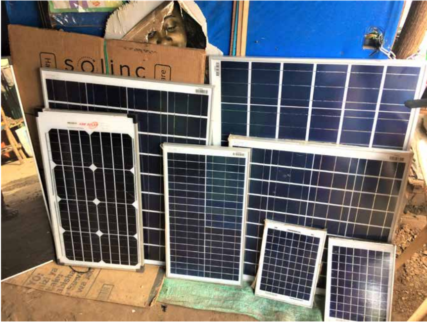
Figure 2.9. ‘Solar panels warehouse’ supplying shops in Kakuma, Kenya.

BBOX and Mobisol are already selling products and services to consumers within camps. The products offered by these companies differ slightly – for example, some have bigger solar panels, more lights or additional appliances available (BBOX 2018; Mobisol 2018; OFFGrid Electric 2018). Most SHSs are primarily bought through a PAYG system, with a deposit ranging from around £12 to £45 and monthly repayments of £5 to £15, dependent on the type of system, over around 36 months (Practical Action 2020). This type of model makes solar home systems more affordable, as they can spread the payments for energy over a number of months or years. Within refugee camps vibrant, small-scale energy economies already exist – as this chapter has demonstrated through the many examples highlighted of shops selling energy products and services within the camps.