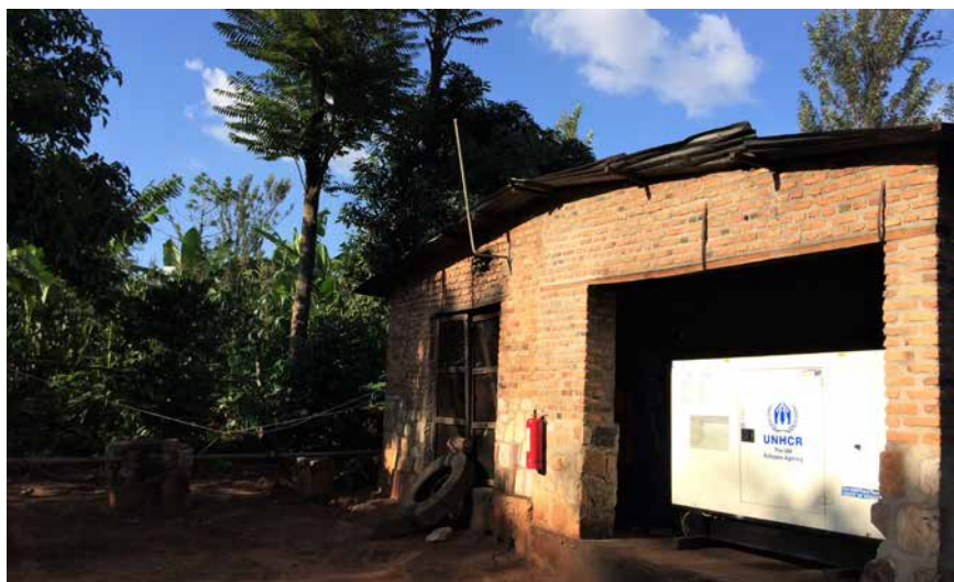
Figure 3.9. Generator equipment in Nyabiheke, Rwanda.

evident that while humanitarian agency staff were perceived to have control over energy resources, they often did not have the knowledge or skills to develop solutions or manage existing resources.