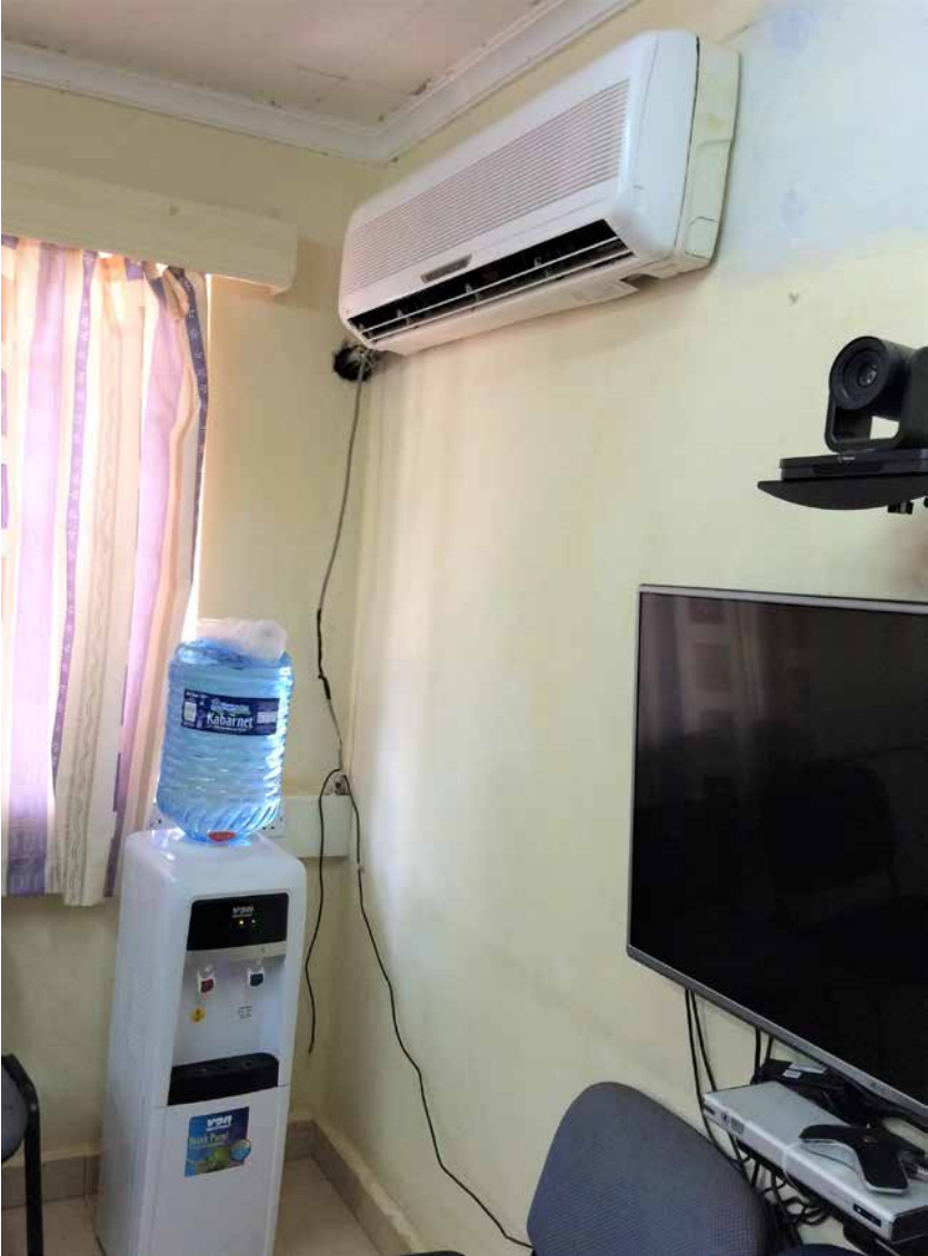
Figure 3.6. Energy appliances in an office in Kakuma, Kenya.

After this interview I regularly ran into this manager during my field-work, and she often asked, ‘Did you find any new energy today?’ and ‘Is this energy?’ and pointed at things. The things she pointed out were always electrical, and yet she was often surprised when the answer was yes. At the