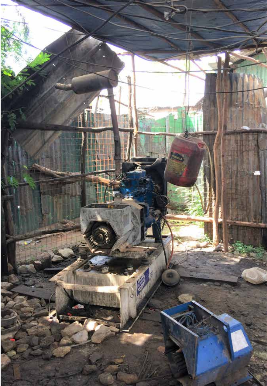
Figure 1.2. Old generator, Kakuma Kenya.