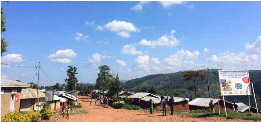
Figure 2.2. Market street showing connecting wires on the left for some businesses in Nyabiheke, Rwanda.

In both countries there were also lively charcoal markets, exchange networks for firewood and fuel, and battery-charging businesses. Energy uses ranging from traditional and fossil-fuel-based technologies to innovative pay-as-you-go (PAYG) models and solar energy technologies. The importance of mobile charging – and the range of technologies, shops and energy sources via which to do this – was very visible across all the camps. In the pictures of solar charging equipment below the family were running a small business using the technology but were mainly focused on using the electricity for their own charging needs, whilst offering their neighbours the opportunity to use any additional power to charge their own items for a small fee. This type of micro-business was common, and local