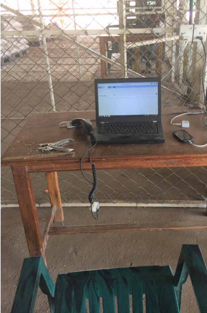
Figure 3.7. Laptops in use at a food-distribution site in Kakuma, Kenya.

This lack of engagement on energy was common within the camps, with many interviewees commenting that energy was for ‘technical specialists’ and that they didn’t know anything about it. One interviewee, a humanitarian worker in Rwanda, even remarked, ‘Who cares, some old diesel generator in a shed somewhere, why would anyone care about this?’ This detachment from and disparagement of energy meant that it was often