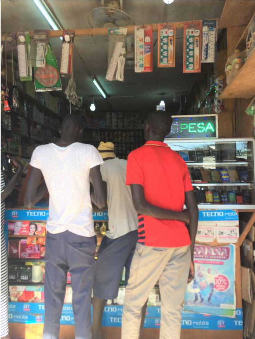
Figure 2.4. A shop using M-PESA mobile money and strip lighting in Kakuma, Kenya.