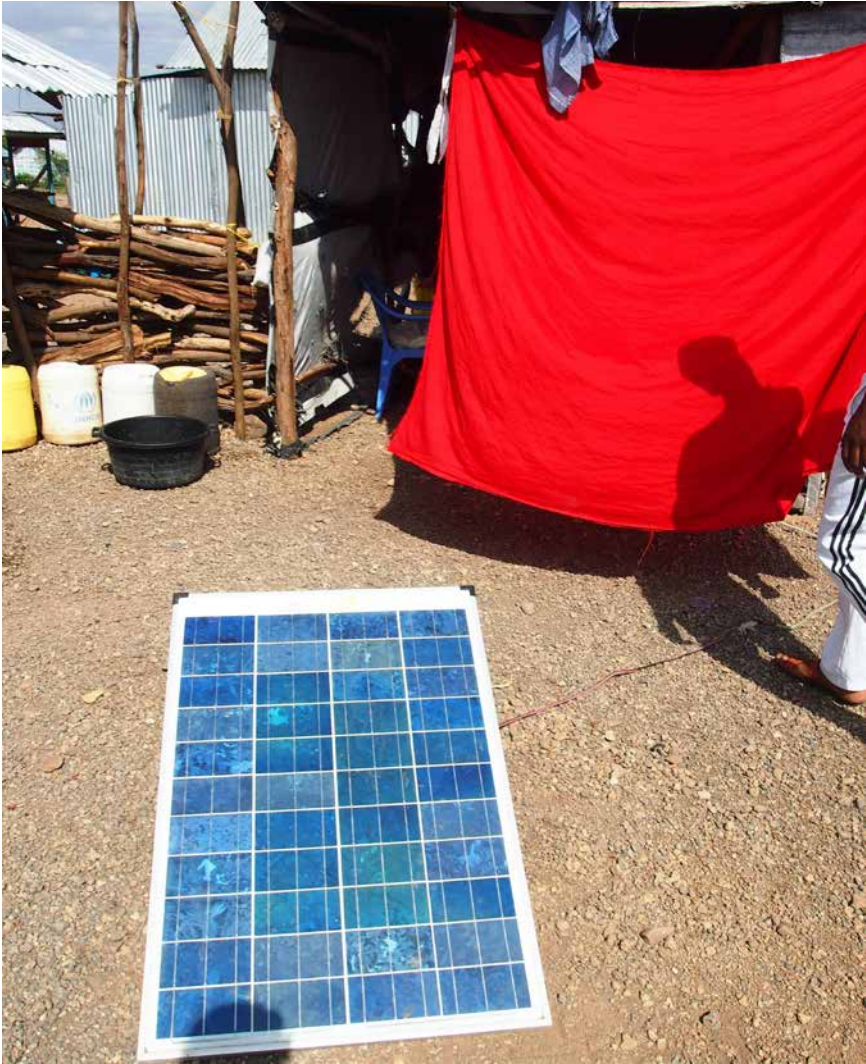
Figure 1.1. Blue solar panel for connection to a home in Kalobeyi, Kenya.

In the terminology of the energy-access world low levels of access are characterised as ‘tier 0’ or ‘tier 1’ under the World Bank’s Multi-Tier Framework (MTF), which is a system for assessing the level of electricity access available (ESMAP 2015). In non-technical speak, tier 0 is roughly equivalent to using either basic lighting technologies – such as candles,