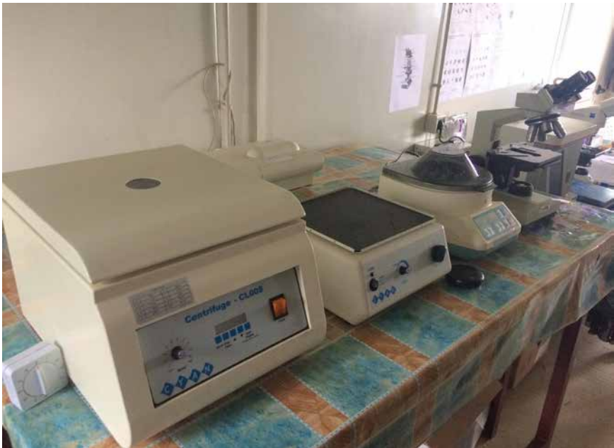
Figure 3.3. Appliances and medical equipment using power in the health centre in Kigeme, Rwanda.

It was always going on and off [the electricity], so I made them [the camp managers] buy me another one [generator]. A separate one, just for us in