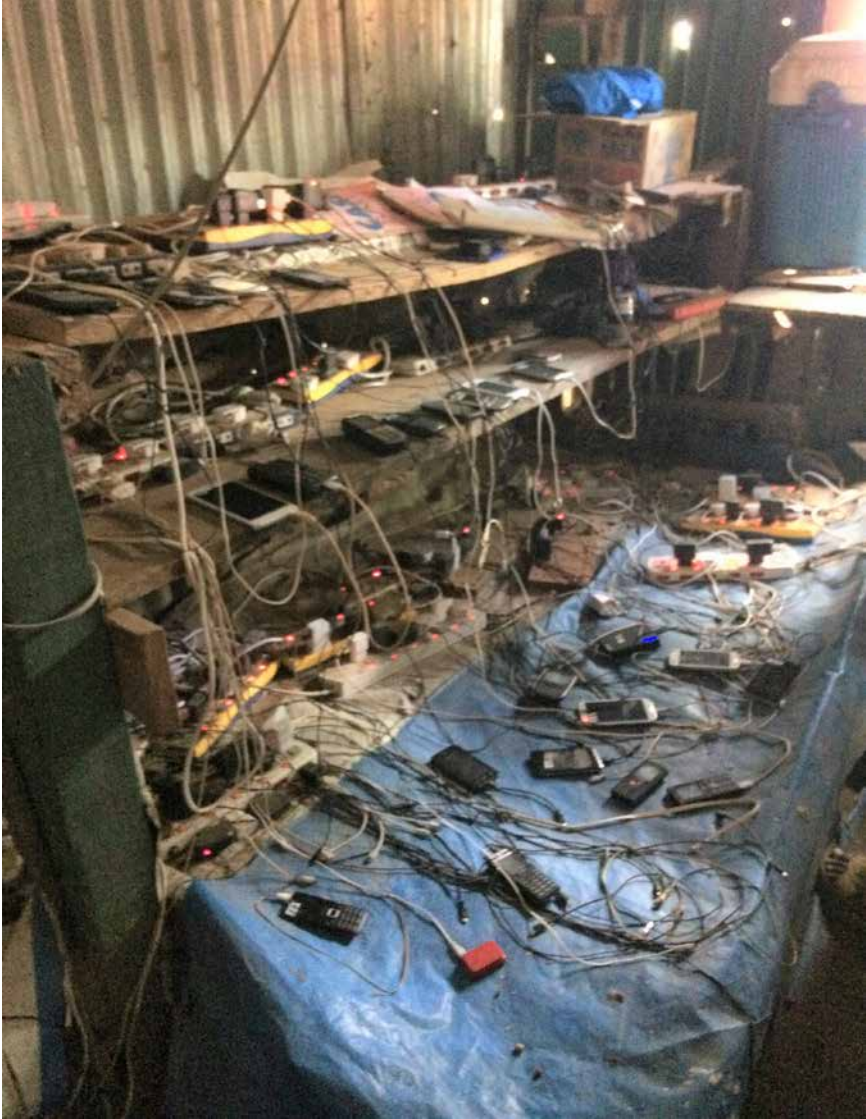
Figure 2.6. Mobile phones being charged inside a shop in Kakuma, Kenya.