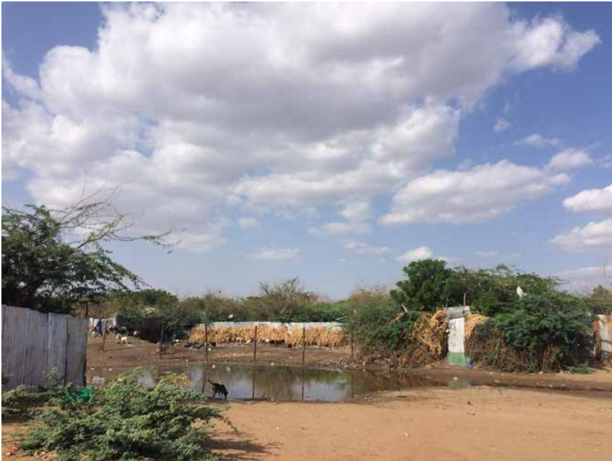
Figure 1.11. View from behind households that do not have lighting in Kakuma, Kenya.

This quote highlights how hard it can be to understand what an absence of energy means to people. Often people would express their desire for