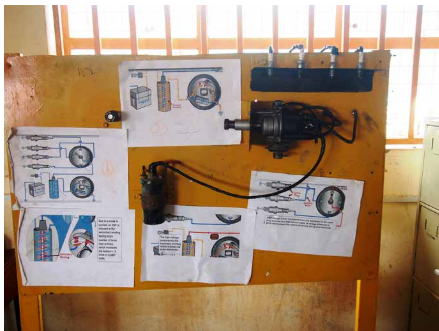
Figure 3.2. Norwegian Refugee Council electrical-training centre: practice board in electrical class in Kakuma, Kenya.

Now is the summer and we only have a couple of summer classes, but in the rest of the year we have many many classes a day and need probably twice as much power. But now we are building another NRC site, another set of classrooms to share with other teaching skills organisations. We loaned the panels and the other generator to them. They are using the power for building, not teaching. For constructions of the classrooms and the offices, so they need a lot more power for all that than us at the moment. We lend them the panels and the power. It is good to share here, then we can do more, have more students, and more progress. (Refugee living in Kenya)