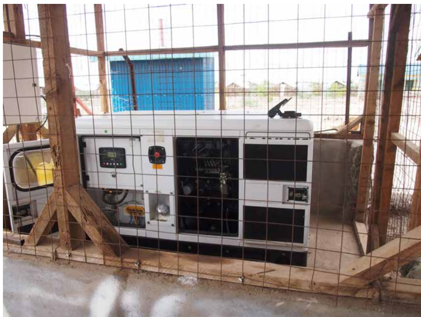
Figure 3.4. Generator providing power for community centre in Kakuma, Kenya.

some refugee businesses, and has enabled substantive and reliable electricity access for the first time. Interviewees described the benefits they saw in solar solutions – as can be seen from the quotes from interviews highlighted below.