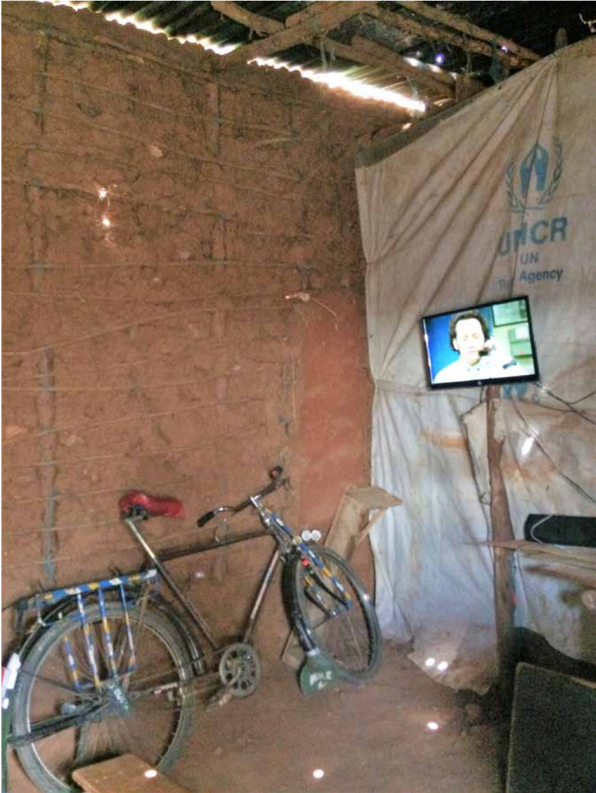
Figure 2.7. Cinema connections, supporting wires and sound system in Nyabiheke, Rwanda.