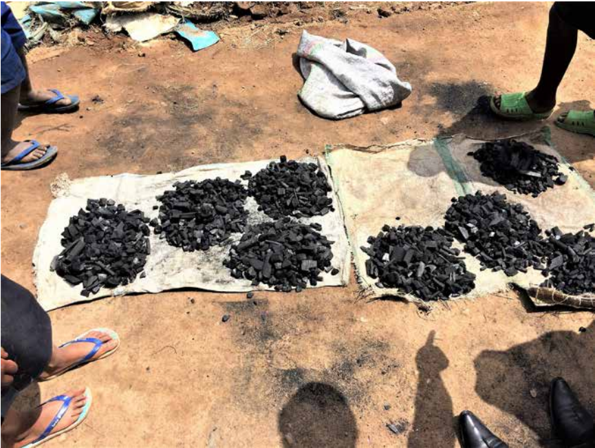
Figure 1.6. Charcoal for sale in Kigeme, Rwanda.

I sell charcoal to everyone in the camp, even the old people who cannot afford too much. It is good business, but I have to walk to the other market [in the town] and buy from there, and carry here. Sometimes my children are helping, but I try to make the older one be in school always. With the lady in the other market I am making deals, she is telling me how much she wants for this fuel bag, and I am talking with her, and she is reducing. She knows refugees – many here in this place – but also she is a refugee. So sometimes I am paying less and sometimes I am paying more for the energy I need, but when I talk with that lady, we decide together. (Refugee living in Rwanda)