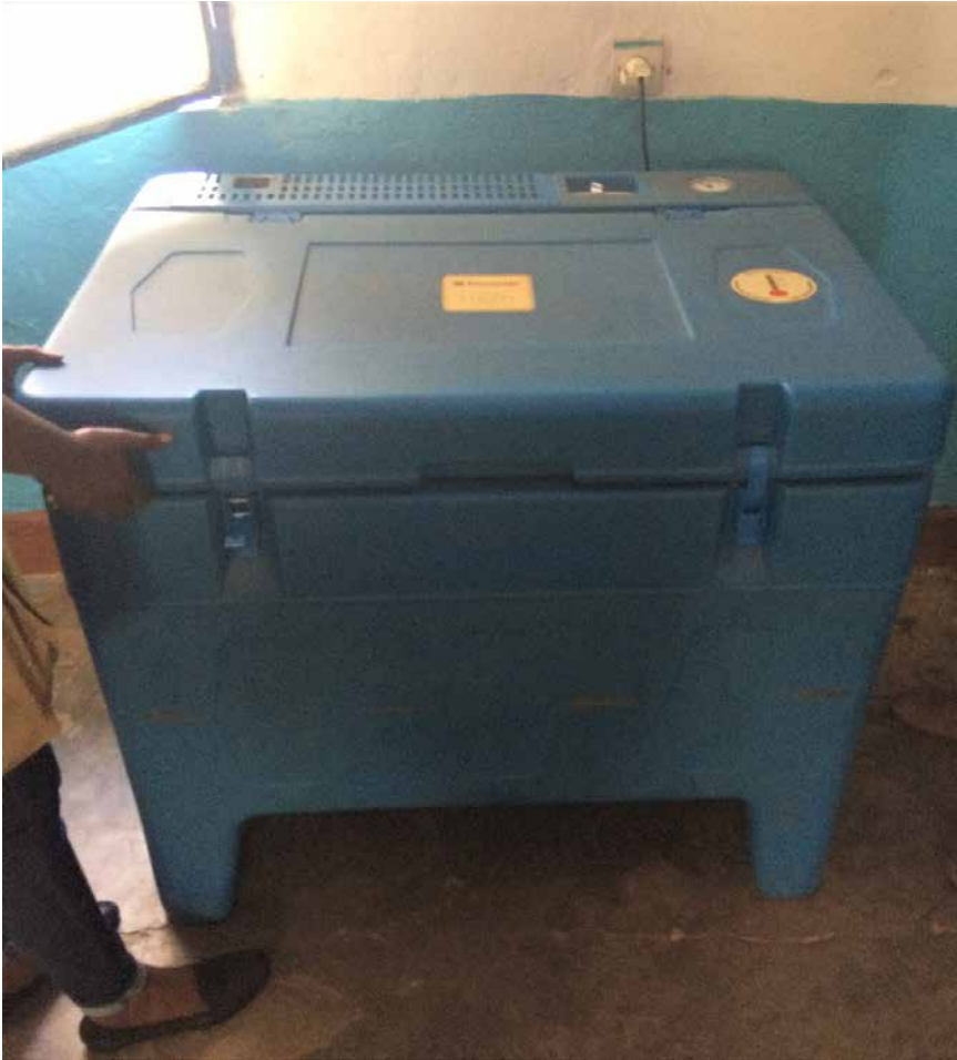
Figure 3.8. Health centre: appliances that were not working, chest fridge for vaccines with temperature monitor to show the range within which vaccines should be kept, Nyabiheke, Rwanda.

refugees within the camps were not allowed to fix the generators and it was a technology that was inaccessible to him. In this case it was unreachable both in terms of location, as the generators were kept off-site in a guarded space outside the camp, and inaccessible as he was not allowed to fix the power and the distribution connections. The level of knowledge on energy within this community was high, and the interviewee highlighted the difference between this and the knowledge of the UNHCR staff member on the issue: ‘He doesn’t know anything about the power’. Here it became