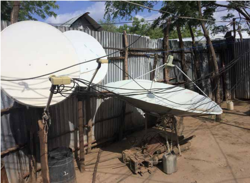
Figure 1.8. TV connections surrounding refugee homes in Kakuma, Kenya.

This view was common in my interviews, with many people highlighting physical connections: how access to electricity enabled people to connect more easily. The quotes below also highlight the physical proximity of homes to wires, summarising how the home of one family is surrounded by electrical wiring due to its placement close to a mini-grid provider, and how they are ‘looking up ... and seeing all the wires’.