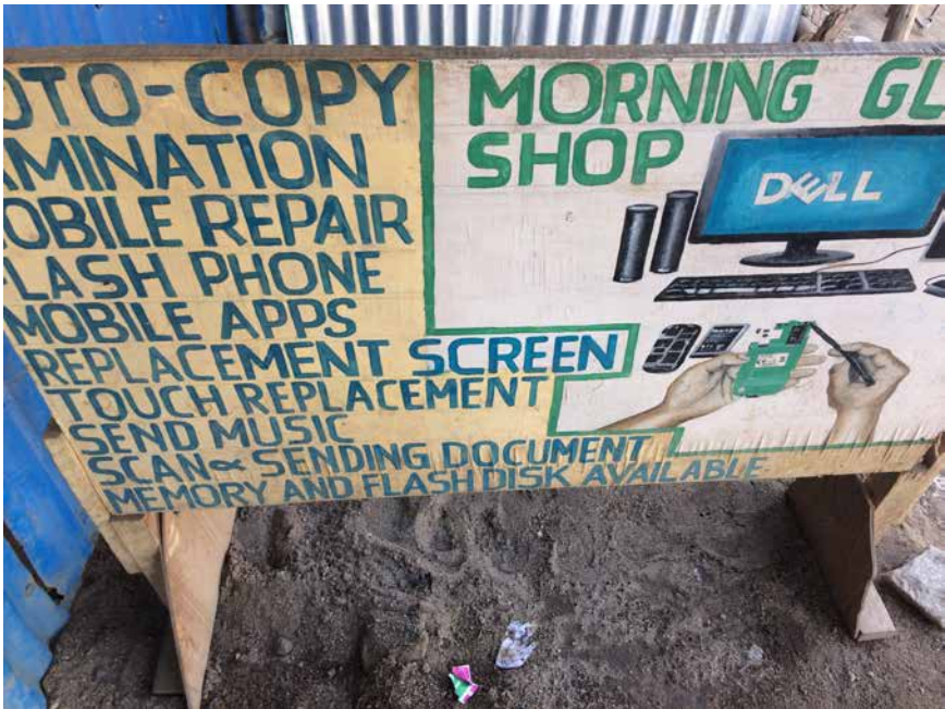
Figure 2.8. Signs for computers and mobile-phone repairs in Kakuma, Kenya.

refugees were buying energy products directly from within the community to make their lives easier, enjoy social activities and to be able to be more productive. This finding reinforces the idea that improving energy access is often about improving quality of life. In this case the services providing quality of life are being offered by the refugee community (in the form of refugee-owned energy businesses), and are inherently connected to other issues such as education and community collaborations.