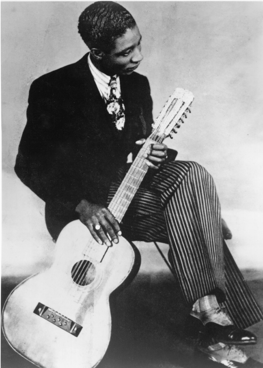
FIG. 6 Publicity photograph of Lonnie Johnson from the 1920s.