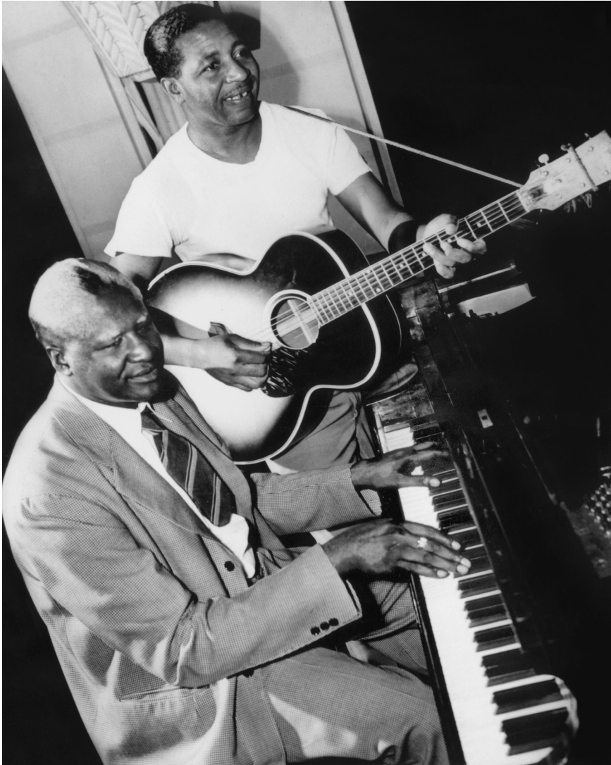
FIG. 7 Blues guitarist Lonnie Johnson and blues pianist Blind John Davis (John Henry Davis) in 1946.