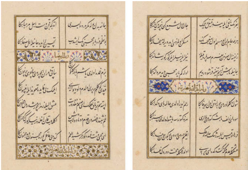
Fig. 2: Museum für Kunst und Gewerbe Hamburg, Dīvân-ı Muhibbî , fol. 4b_5a.

Let those of glad countenance cry "Well done!" from the heart. 47