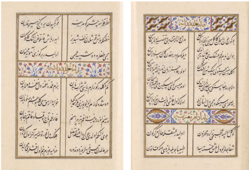
Fig. 3: Museum für Kunst und Gewerbe Hamburg, Divân-ı Muḥibbî , fol. 149b–150a.

This poem may have been excluded from later collections perhaps because of its slightly defective meter, but other reasons, e.g. the editor's predilections or simple fortuity are also conceivable. Nevertheless, we see how eagerly Muḥibbî promoted himself as the ultimate lover. Though madness belongs to the core qualities of a lover to which Muḥibbî also refers to, it is the ontological challenge of death at the pinnacle of this poem. As in the former poem, Muḥibbî's eagerness to display the utmost form of madness divides the lyrical persona, along with Muḥibbî from the ruler, Sultan Süleymân. So, the dichotomy of madness and rule seems to have been irrelevant, and there was a strict division between the realm of poetry and politics.