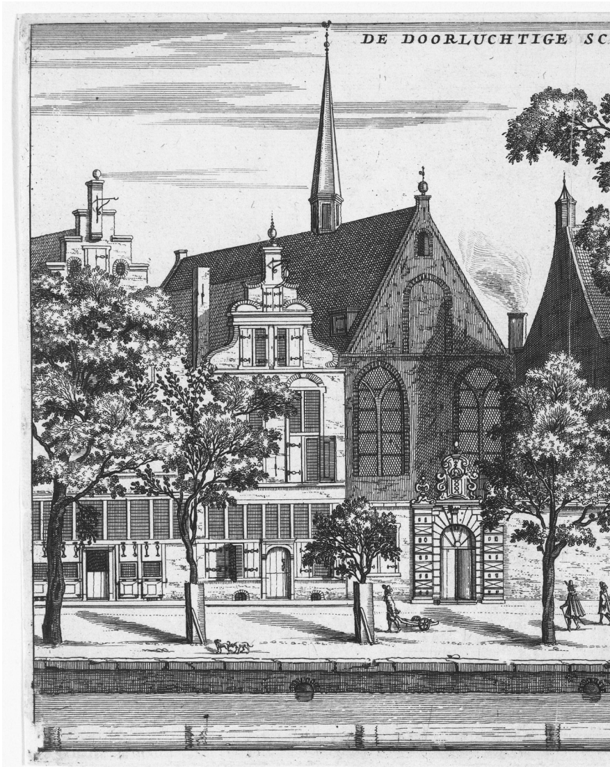
View of the Athenaeum Illustre on the Oudezijds Voorburgwal, anonymous, 1663–1665. Rijksmuseum, Amsterdam