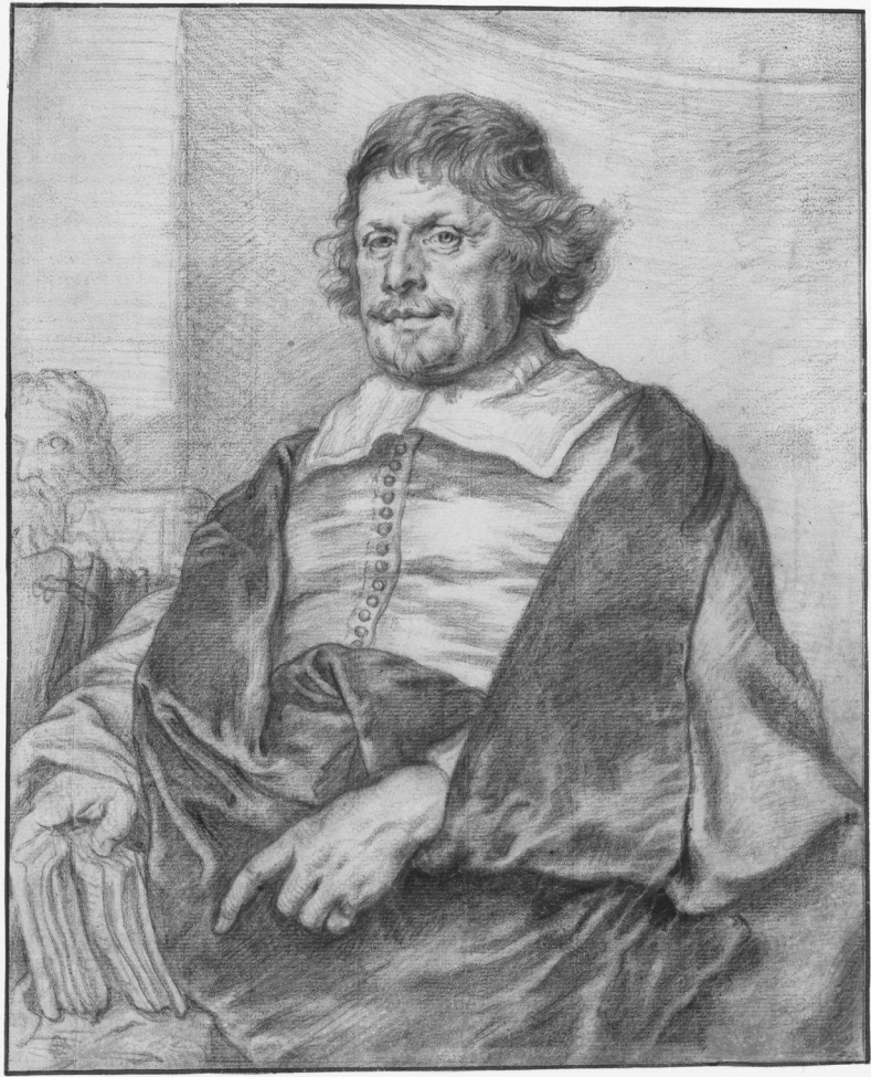
Portrait of Caspar Barlaeus by Joachim von Sandrart, made between 1637 and 1643. Rijksmuseum, Amsterdam