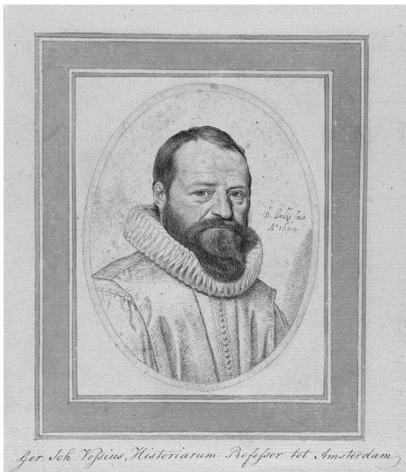
Portrait of Gerard Vossius by David Bailly, 1624. Rijksmuseum, Amsterdam