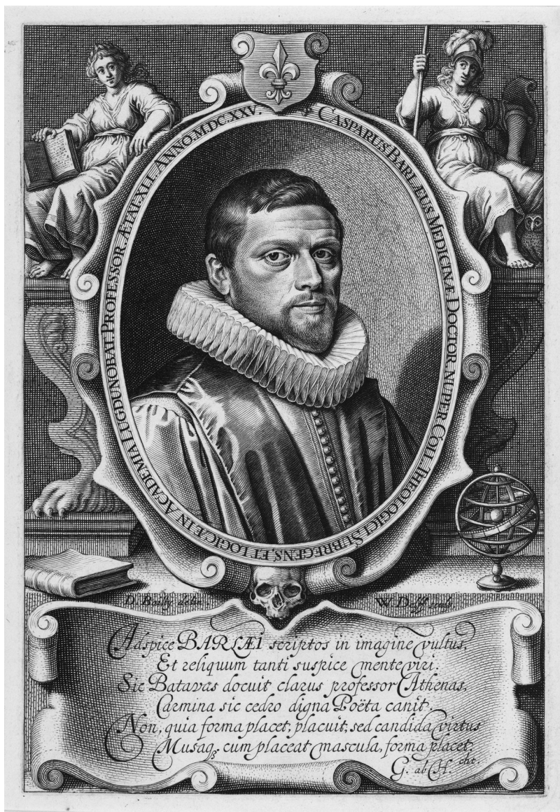
Portrait of Caspar Barlaeus in 1625, by Willem Jacobsz Delff. Rijksmuseum, Amsterdam