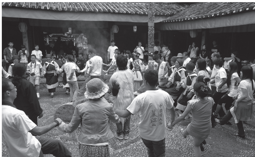
Figure 3.5 The dancing of Remeicuo in the middle of the courtyard