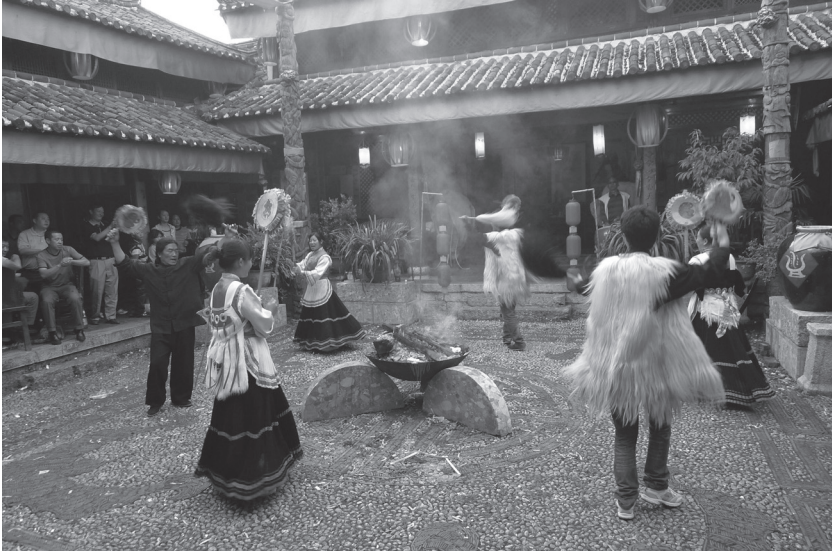
Figure 4.4 The Naxi leba dance in the wedding ceremony