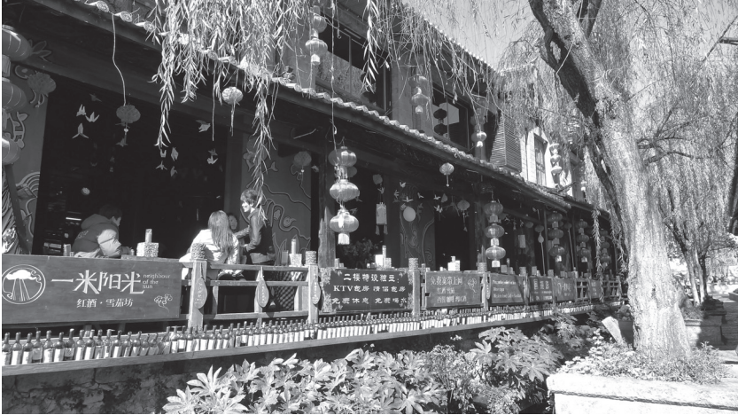
Figure 2.4 Bar streets in the Old Town