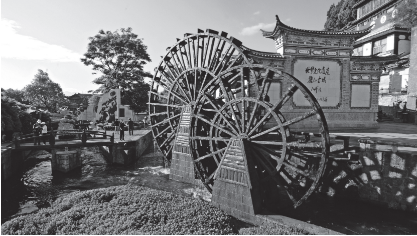
Figure 2.2 The newly built entrance to the Old Town of Lijiang