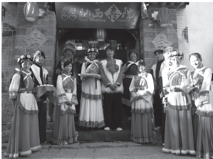
Figure 4.1 The local actors at the Naxi Wedding Courtyard