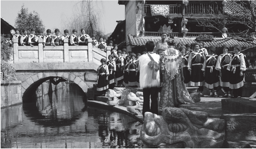
Figure 3.3 Dongba Fuhua chants and throws rice into the river