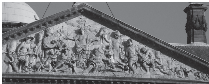
Figure 1 – Artus Quellinus, Amsterdam and the continents, c. 1648, frieze in the west (rear) tympanum of the Royal Palace, the Dam, Amsterdam.

Bull, a horn of plenty and bunches of grapes to show her natural riches and sophistication, and books to show her learning and wisdom. Africa, further to the left, is represented by a naked (and therefore primitive) woman; she has an exotic lion and elephant with her, and is bringing ivory and bales of goods as tribute. To the right of Amsterdam, we see Asia, accompanied by a camel and wearing a turban; she has (as always) a censer and some Turkish tulips, reminding us of the tulip fever of 1636-37. On the extreme right is America, with a feather headdress and a crocodile, tobacco, sugar and silver-mining. Amsterdam is of course the star of this show, but she is the capital of the Dutch Republic, a great trading nation with a worldwide network, and she is herself part of Europe, the best and most powerful queen of the continents. This is a piece of Eurocentric, Dutch, Amsterdam promotion, and it is an image found all over the Netherlands in the 17th century in architecture, books, paintings, sculpture, and many other forms of applied art. Identifying with Amsterdam, the Netherlands and Europe goes perfectly together, and indeed the three levels strengthen each other.