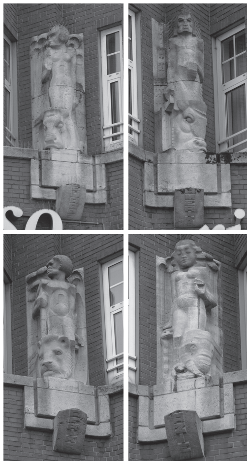
Figure 4 – Theo Vos, sculptures of the continents on the Hotel NH Carlton, Vijzelstraat Amsterdam, c. 1928.

nation and Europe, and all support each other. A less well-known example is the Hotel NH Carlton Amsterdam (Figure 4), also on the Vijzelstraat, originally constructed to help with the shortage of hotel accommodation for the Amsterdam Olympic Games of 1928. It is festooned with all sorts of stylised and exotic images of all parts of the world: to welcome all the competing nations at the games, we