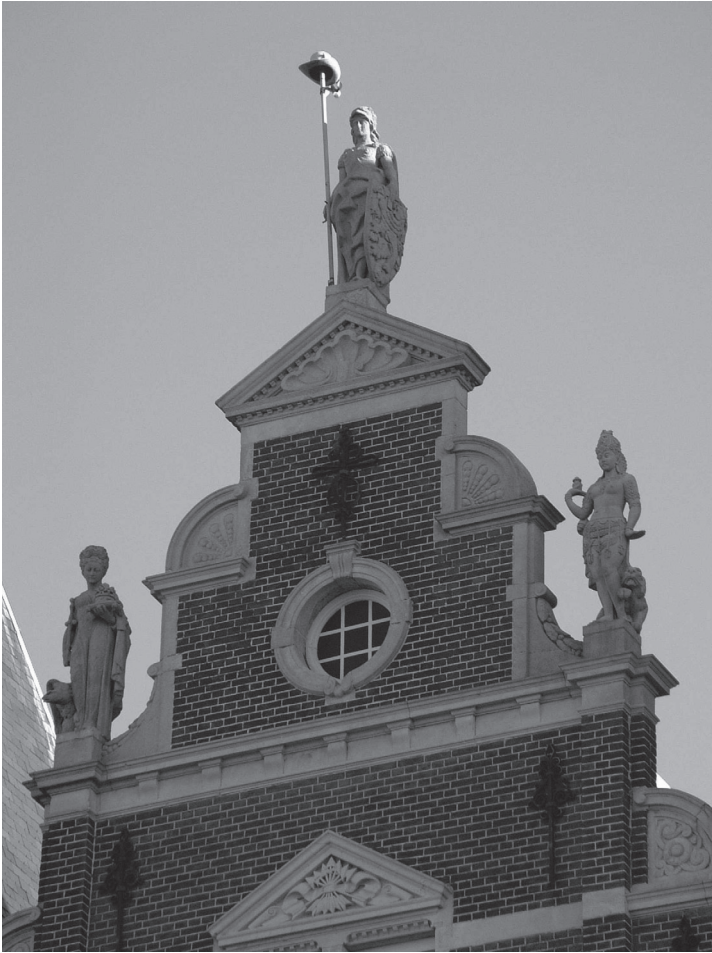
Figure 3 – Willem M. Retera, statues over the entrance to the Royal Tropical Institute, Amsterdam, c. 1920.

also elsewhere in the Netherlands (and indeed further afield). Besides the Shipping House by J. van der Mey, and the Stock Exchange by H.P. Berlage, one could also point to the massive bulk of 'De Bazel' on the Vijzelstraat, built in 1924 by K.P.C. de Bazel as the headquarters of a colonial bank ( De Nederlandsche Handelmaatschappij ). All these edifices celebrate the city, the