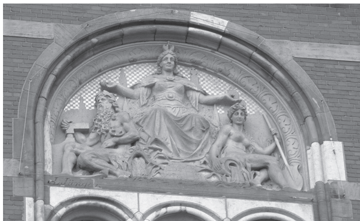
Figure 2 – Ludwig Jünger, Amsterdam and the continents, central and left tympani, Central Station façade, Amsterdam, 1880s.