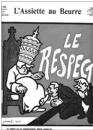
Figure 3 'Respect'. Drawing by Gustave-Henri Jossot for L'Assiette au Beurre , 1907, available at http://www.assietteaubeurre.org/respect/respect_f1.htm [June 2010].