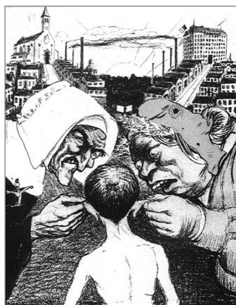
Figure 2 ‘Choisis, tu es libre’ [‘Choose, you’re free’]. Drawing by Auguste Roubille for a special issue of the anarcho-syndicalist magazine L’Assiette au Beurre , on the freedom of education, 1904.

Rights of Man and the Citizen. Note the strong symbolic opposition between religious belonging and citizenship. Public school is presented as a crucial institution for the transition from a ‘natural’ provincial situation of communal social hierarchy to a ‘civilised’ urban democracy made emblematic, for example, by the orderly partitioned windows. These windows act as mediators of a modern, mathematical view of the natural world ‘outside’. If we push the interpretation a little, they function as symbols for the equality and (moral) freedom of all individual citizens.