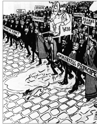
Figure 4 'Toujours les idoles' ['Idols forever']. Drawing by Jules-Félix Grandjouan for L'Assiette au Beurre , special issue on the freedom of education, 1904.

dental. The first great laïc educational law, of August 1879, obliged every department in France to have a women's teacher training college. Jules Ferry, then minister of education, argued that Catholicism upheld its influence through women, positing that 'women must belong to Science (and not) to the Church' (quoted in Baubérot 1998: 108). The smoking factory chimneys in the background of the cartoon suggest that underneath the superficial difference between public and private schools is found the same inescapable 'capitalist hell' (Langlois 1996: 109).