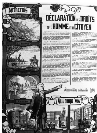
Figure 1 “La déclaration des droits de l’homme et du citoyen” [‘The Declaration of the Rights of Man and the Citizen’]. Affiche de Charles Fournigault, 1905.