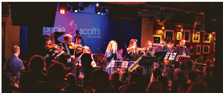
Figure 9.1 Kalpadruma Band live at Ronnie Scott's 2023.

In comparing various types of [musical] models, we find that those of jazz are relatively dense, those of Persian music, of medium density, and those of an Arabic taqsim or an Indian alap , relatively lacking in density. Figure bass, and Baroque music in which a soloist improvises ornamentation, are perhaps