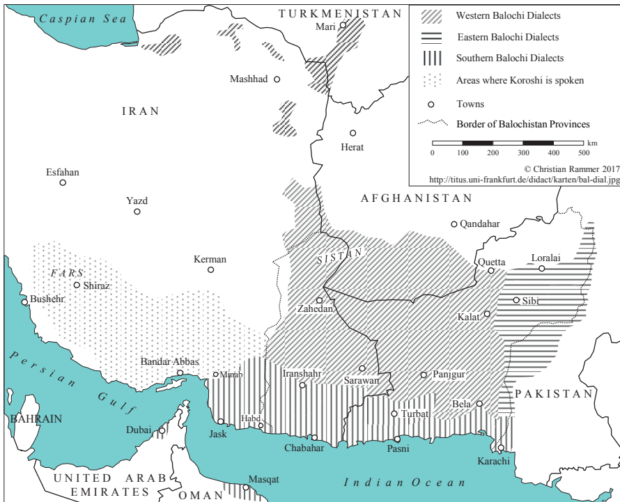
Figure 1. The Balochi language area with its broad dialect divisions

Balochi is an Iranian language spoken in Pakistan, Iran, Afghanistan, the Gulf States (particularly Oman and the United Arab Emirates), Turkmenistan, India, and East Africa. It is difficult to estimate the total number of Balochi speakers, since there are no official statistics on people's first language in the countries where Balochi is spoken. However, informal estimates suggest that Balochi is spoken by at least 10 million people, and that there are several million people who identify themselves as Baloch but speak another language as their first language.